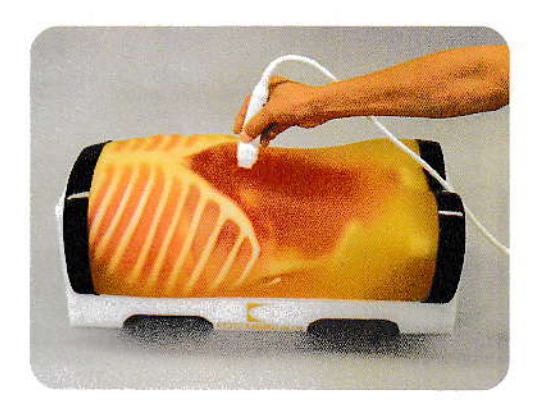
The phantom can be scanned with actual ultrasound devices.

* The map of simulated hemorrhages and tumors is on the backside of this manual.