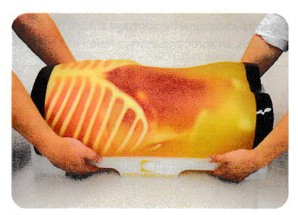
① The Phantom is heavy.For your safety,always carry the phantom with two people.