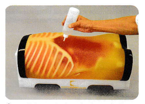
② Spread ultrasound gel over the phantom body.